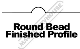
Round Bead Finished Profile