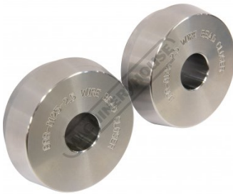
Wire Bead Closers