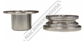
Wire Bead Male and Female Roll Profile View