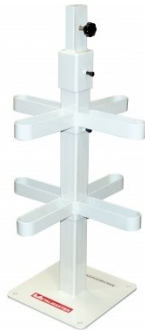
S2238 Steel Dolly Stand