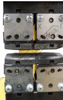
Jaws Front View