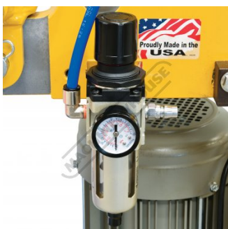
Air Pressure Regulator