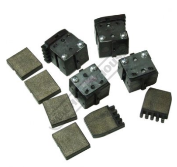
Comes with a Set of 4 Quick Change Magnetic Jaws