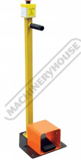
Foot Control Emergency Stop