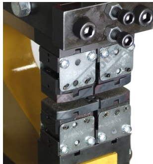
Reversible Jaws for Shearing and Stretching