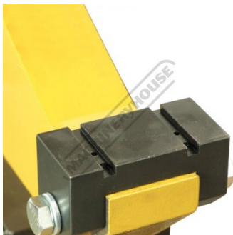
Jaw Slide in Base