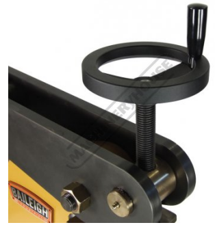
Jaw Gap Adjustment Hand Wheel