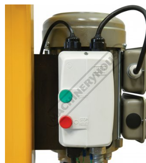
Start Stop Power Switch