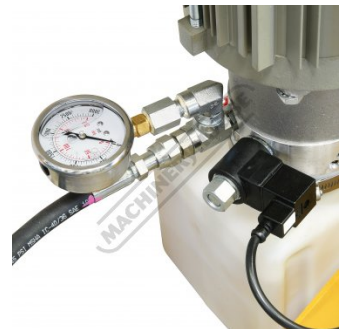
Hydraulic Pressure Gauge