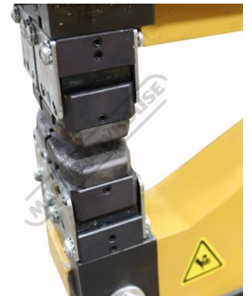
Jaws Side View