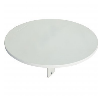
S2240 Round Steel Table for Sand Bag