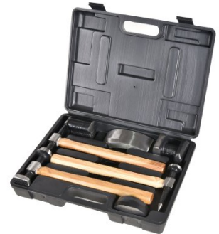
H885 Auto Panel Restoration Kit - DIY