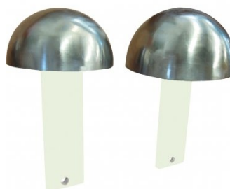
S2235 Mushroom Steel Dome Dolly Set - 2 Piece