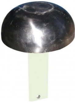
S2237 Bowl Steel Dome Dolly