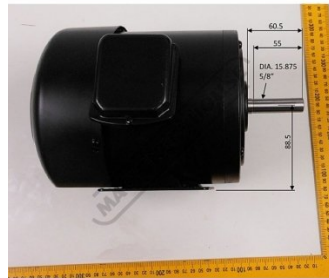
BL085 MOTOR 240V 3.5A 375W 0.1 BL085 MOTOR 240V 3.5A 375W 0.2