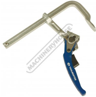
Shown with Clamp Fully Open