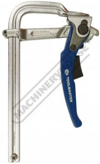
Shown Fully Closed