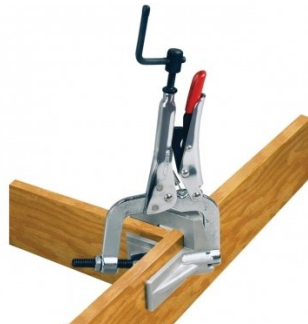
W1013 Corner Clamping Plier