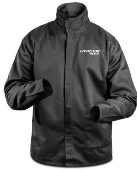
W1003 Rogue Welding Jacket