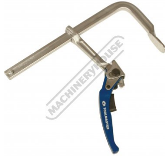
Shown with Ratchet Fully Open