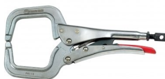
W1016 Locking C-Clamp - Round Tip