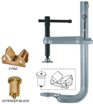
W1026 4 In One Utility Clamping System