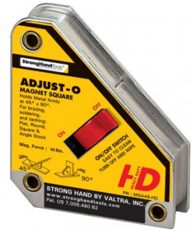
W1007 Adjust-O Magnet Square - Heavy Duty