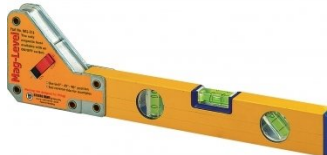
W1020 Magnetic Level