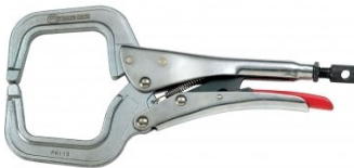
W1016 Locking C-Clamp - Round Tip