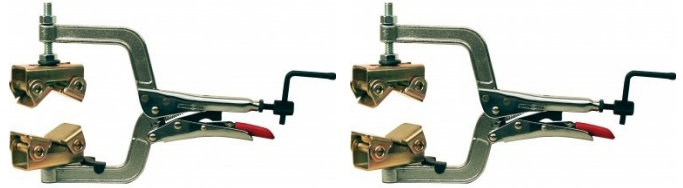
W1015 Pipe Plier