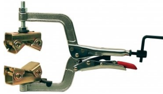
W1014 Pipe Plier - Large