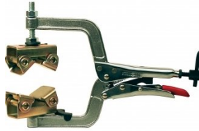
W1014 Pipe Plier - Large