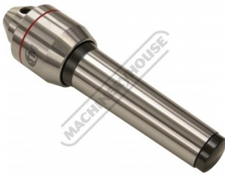
Live Centre Rear View