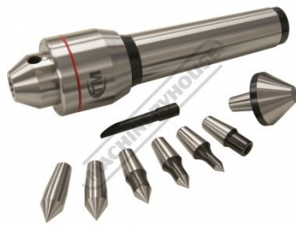
Set Shown With Tips