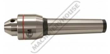
Live Centre Side View