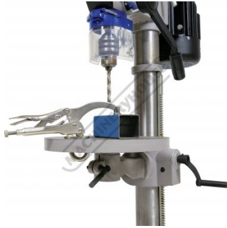
Shown Clamping Job on an Optional Drilling Machine Low View