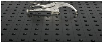
Shown on Welding Table Jaw Closed