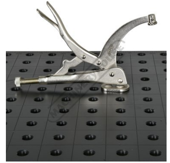
Shown on Welding Table Jaw Open