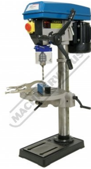
Shown Clamping Job on an Optional Drilling Machine