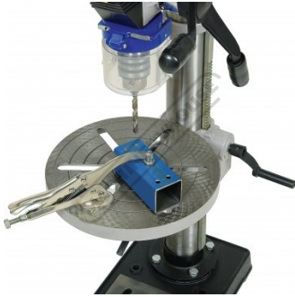
Shown Clamping Job on an Optional Drilling Machine Close Up