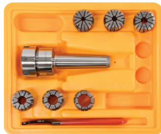
C926 Collet & Chuck Set - 20 Piece