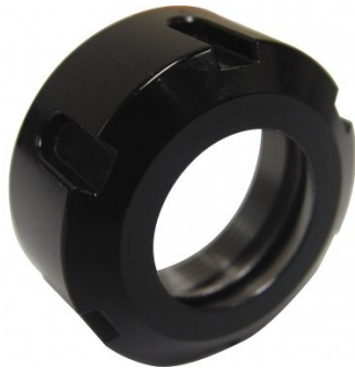
C117 Collet Nut ER32