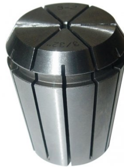
C903 ER32 Collet