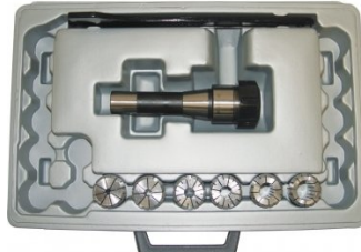
C923 Collet & Chuck Set - 8 Piece