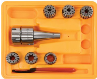
C9245 Collet & Chuck Set - 8 Piece