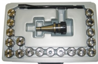
C928 Collet & Chuck Set - 20 Piece