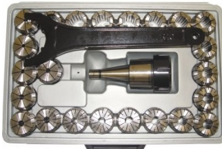
C965 Collet & Chuck Set - 25 Piece