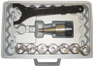
C961 Collet & Chuck Set - 9 Piece