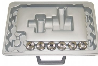
C921 ER32 Collet Set - 6 Piece