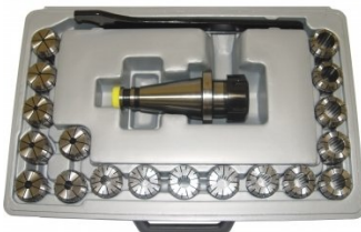
C929 Collet & Chuck Set - 20 Piece