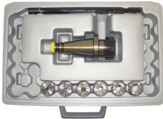
C925 Collet & Chuck Set - 8 Piece