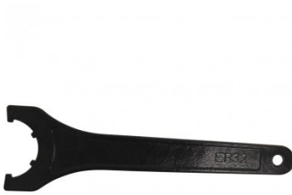
C932 ER32 Collet Chuck Wrench