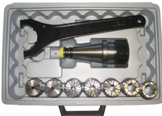
C962 Collet & Chuck Set - 9 Piece