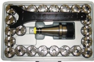
C966 Collet & Chuck Set - 25 Piece