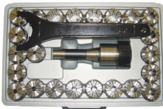
C964 Collet & Chuck Set - 25 Piece