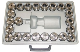
C958 ER40 Collet Set - 23 Piece