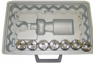
C958 ER40 Collet Set - 23 Piece