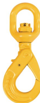
H330 Self Locking Swivel Hook