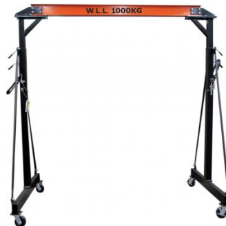
C188 Mobile Girder Rail Gantry