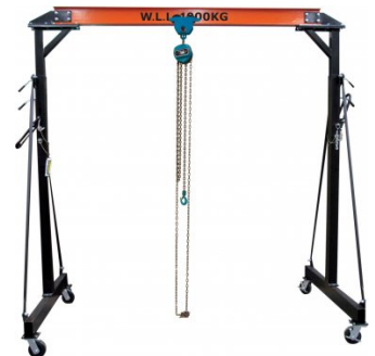
K088 Mobile Girder Rail Gantry Package Deal