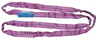
H308 Round Slings