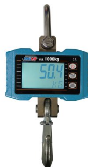
C191 Digital Crane Scale