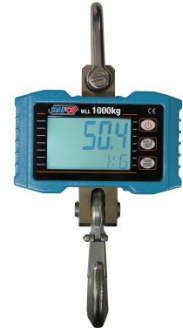
C191 Digital Crane Scale