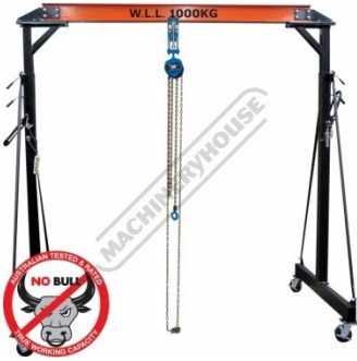
K090 Mobile Girder Rail Gantry Package Deal