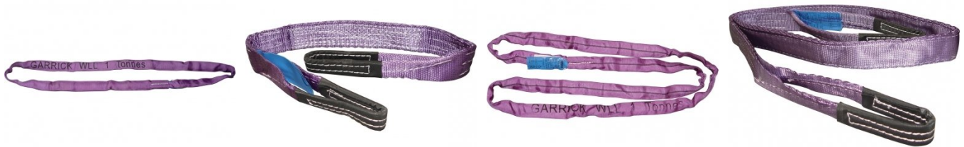
H308 Round Slings