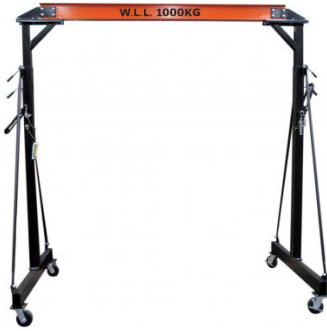
C188 Mobile Girder Rail Gantry