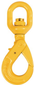
H330 Self Locking Swivel Hook