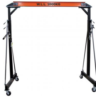
C188 Mobile Girder Rail Gantry