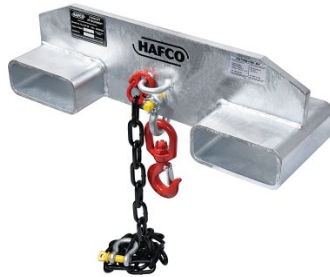
C195 Forklift Jib Attachment