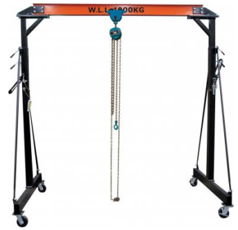
K088 Mobile Girder Rail Gantry Package Deal