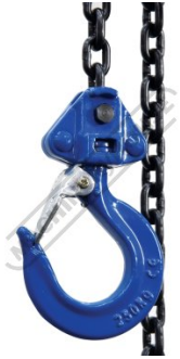
Bottom Hook Assembly