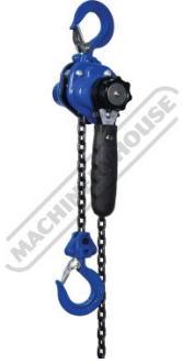
Main View Handle Down