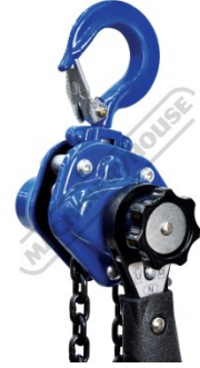
Lever Handle Mechanism