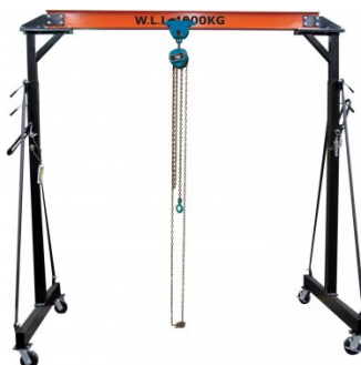
K088 Mobile Girder Rail Gantry Package Deal