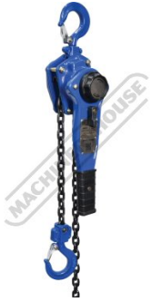
Main View Handle Down