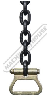
Length Chain End