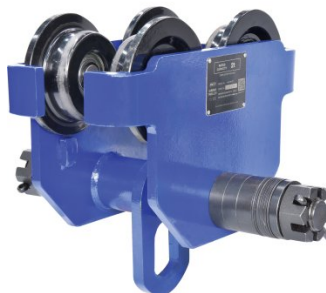
C148 Girder Trolley