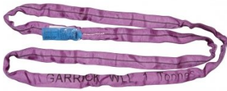
H308 Round Sling