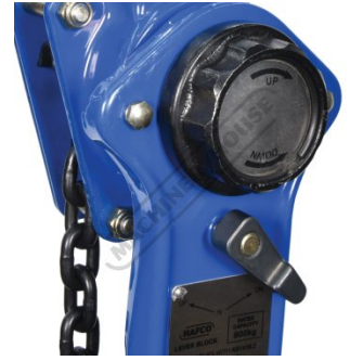
Lever Handle Mechanism