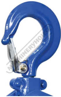
Top Hook Assembly