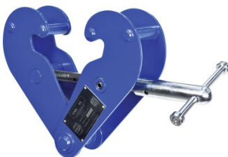
C146 Girder Clamp