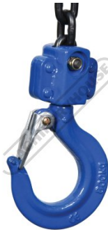
Bottom Hook Assembly