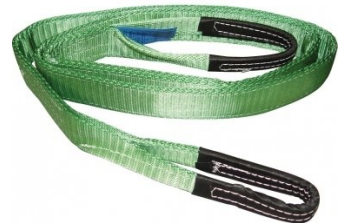
H324 Flat Sling