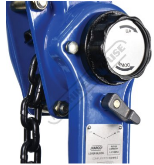
Lever Handle Mechanism