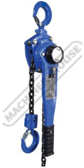
Main View Handle Down