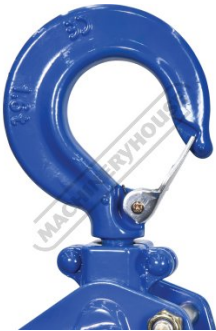
Top Hook Assembly