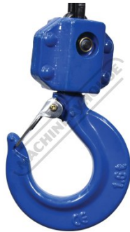
Bottom Hook Assembly