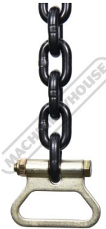
Length Chain End