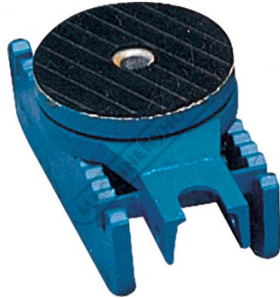
Shown With Optional Skate