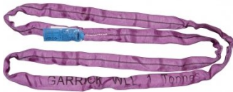
H308 Round Sling