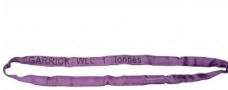
H300 Round Sling