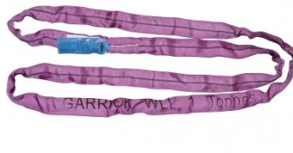
H305 Round Sling