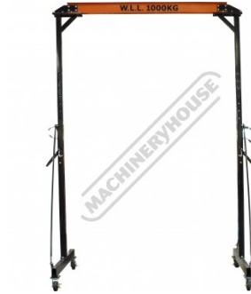
Shown at Full Height