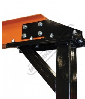
Heavy Duty Beam Support