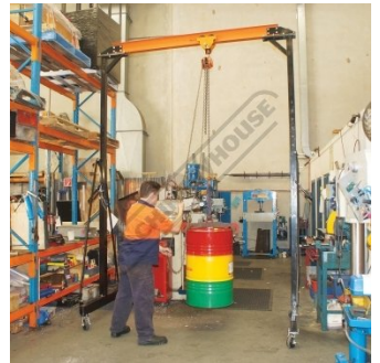
Shown Lifting Oil Drum 2