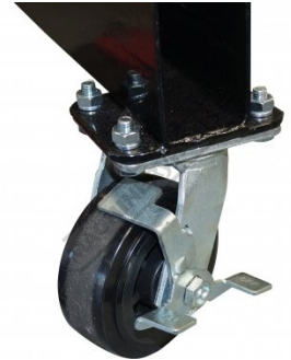
Swivel Wheels with Lock