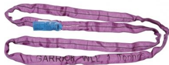
H308 Round Slings