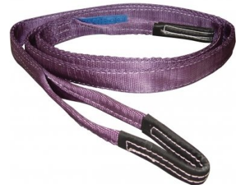
H320 Flat Slings