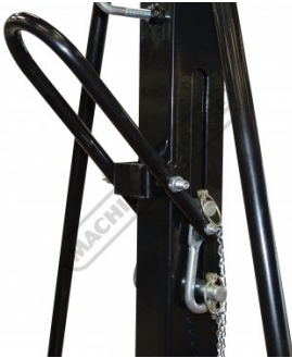
Safety Height Locking Pins