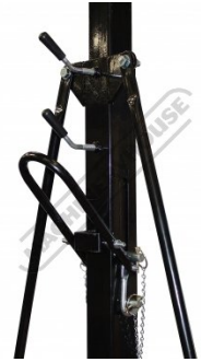
Lever Action Beam Height Adjustment