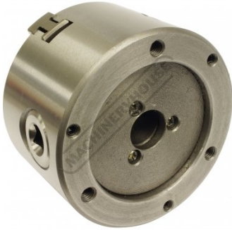
Back Plate Mount