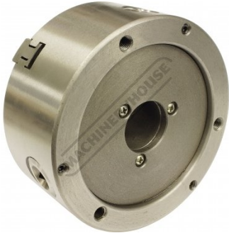
Back Plate Mount