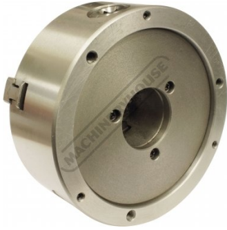
Back Plate Mount