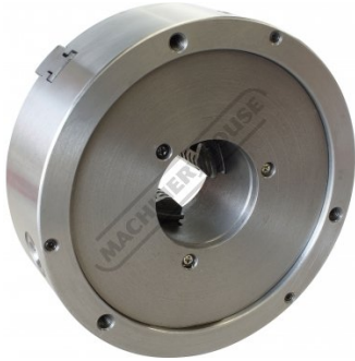
Back Plate Mount