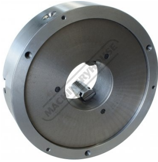
Back Plate Mount