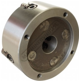
Back Plate Mount