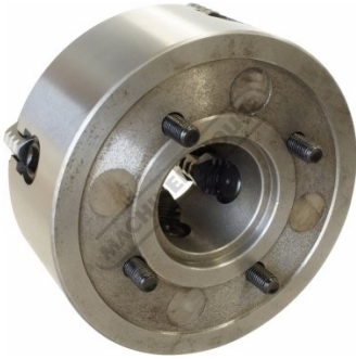
Back Plate Mount