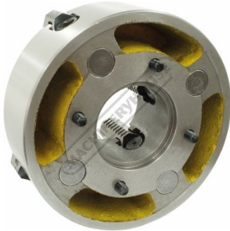
Back Plate Mount