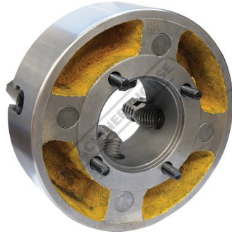
Back Plate Mount