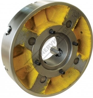
Back Plate Mount