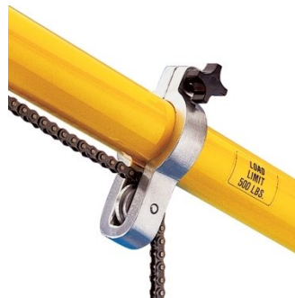
A358C Bolt Down Adaptor