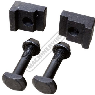
Nuts and Bolts