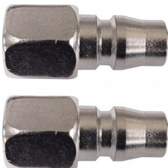
F950 High-Flow Air Fittings