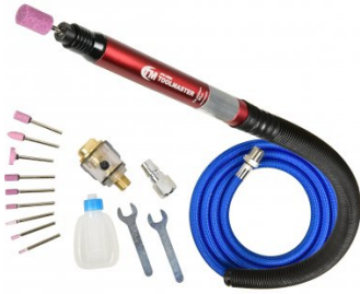
A043 Air Micro Die Grinder Kit