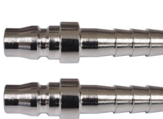
F955 High-Flow Air Fittings