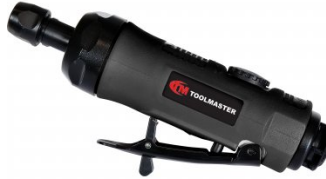
A040 Air Die Grinder