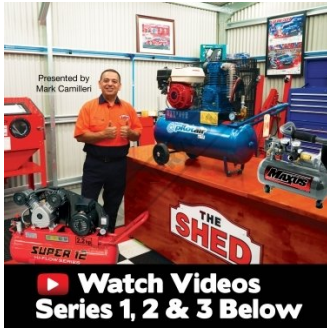
Compressors Watch Video Web Image