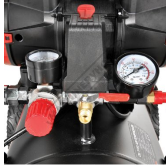
Pressure Gauge & System Valve