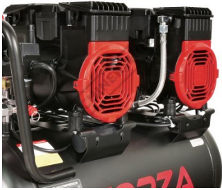
Twin 2hp Motors