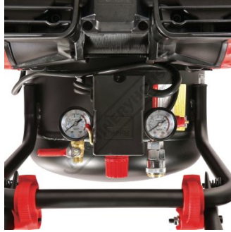
Pressure Gauge & System Valve