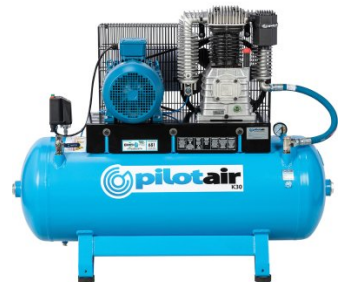
C525 Classic Industrial Series 3 Phase Reciprocating - Pilot Air Compressor