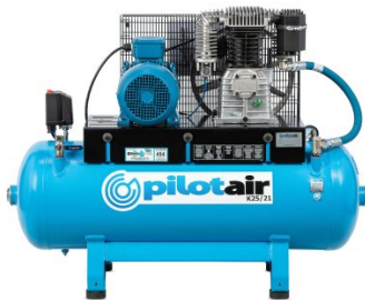
C521 Classic Industrial Series 3 Phase Reciprocating - Pilot Air Compressor