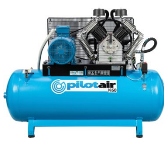
C532 Classic Industrial Series 3 Phase Reciprocating - Pilot Air Compressor