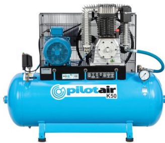
C529 Classic Industrial Series 3 Phase Reciprocating - Pilot Air Compressor