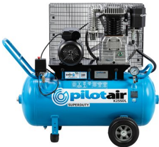
C511 Pilot Super Duty Air Compressor