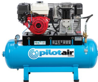
C507 Classic Industrial Series Trade Petrol Reciprocating - Petrol Powered - Pilot Air Compressor