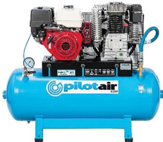
C509 Classic Industrial Series Trade Petrol Electric Start Reciprocating - Pilot Air Compressor