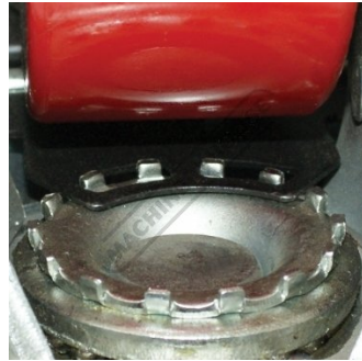
Foot Brake With Swivel Base Lock