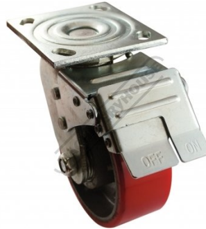
Foot Brake Activated