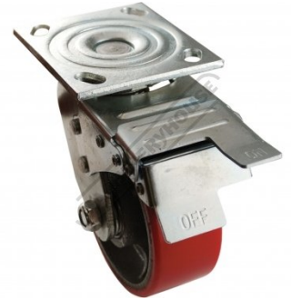
Foot Brake Released