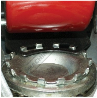
Foot Brake With Swivel Base Lock