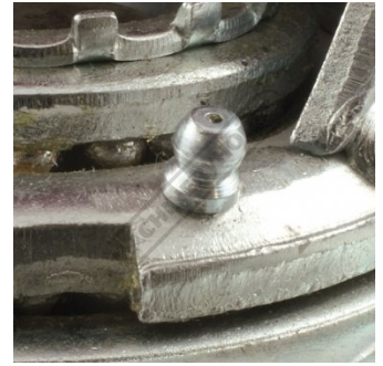
Ball Bearings Base with Greasing Nipple