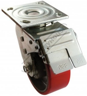
Foot Brake Activated