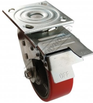
Foot Brake Released