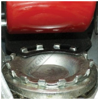
Foot Brake With Swivel Base Lock