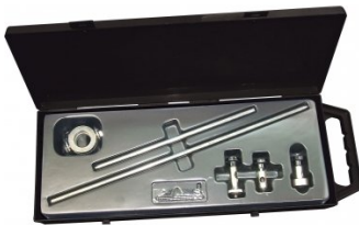
C660 Plasma Circle Cutting Kit