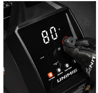
HD Backlit Interface