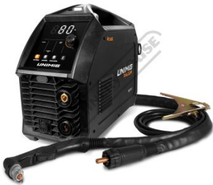
Shown with Included Accessories Front View