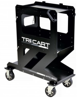
W2415 TRI-CART Multi-Machine Welding Trolley