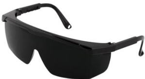
W107 Safety Specs - Shade 5