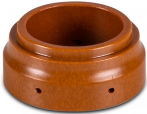
C594 Swirl Ring