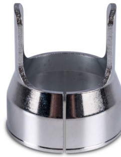
C596 Stand-off Guide