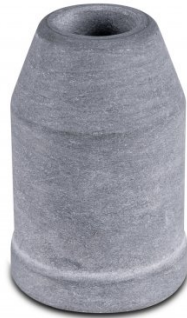
C595 Retaining Cup Heavy Duty